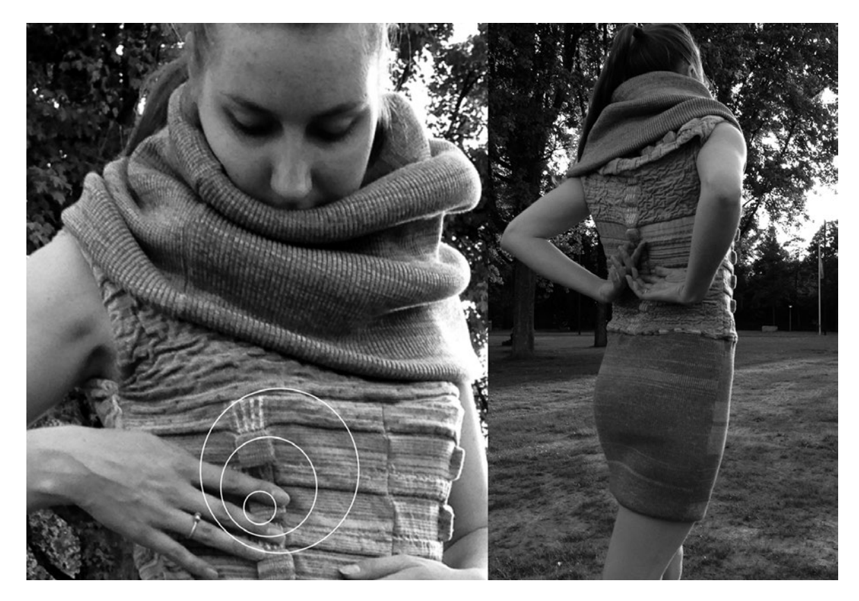
Fig. 1. Left: front of Vibe-ing with two rows of pockets. The white circles visualize the vibration of the modules. Right: back, with the pockets containing the vibration and touch modules on the spine and shoulders. The silver lines are the connection lines between pockets