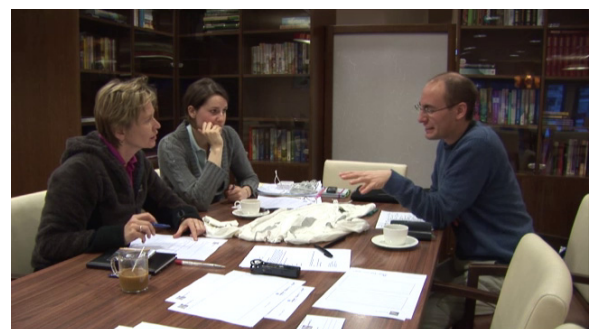
Fig. 2: Hand spread towards prototype (l. 12 in transcript, Excerpt 1 continued)

In the continuation of this excerpt (see Excerpt 1 continued below), the designer can be understood to instruct the participants to take the prototype into account (l. 12), by asking a question of how the feature is expressed ('terugkomen' come back ). B not only verbally encourages to link the insight to the prototype, but also by his gaze and his spread hand addresses the prototype as central.