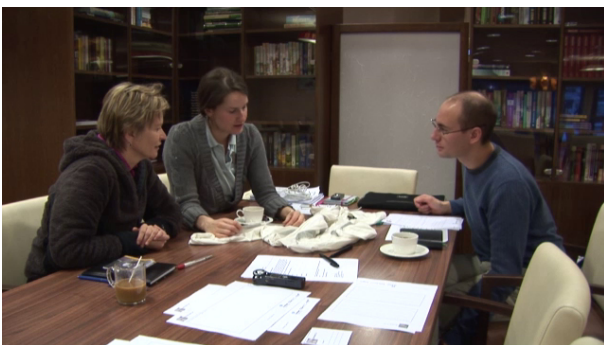
Fig. 4: Holding the prototype, l. 2-4, Excerpt 4