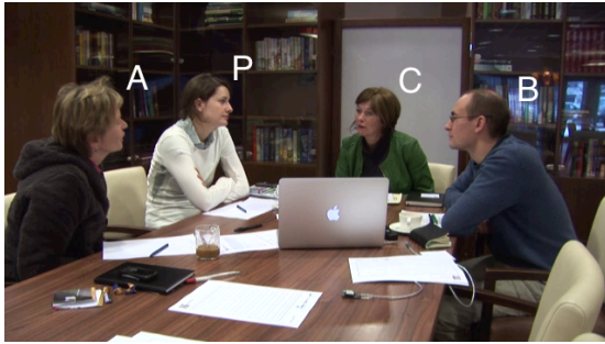
Fig. 1: Sitting arrangement

Importantly, only one participant, C, gets introduced to the prototype in this session. Two participants saw and to some extent tried the shirt out before the session. The session thus to a certain degree concerns their earlier experiences with the shirt.