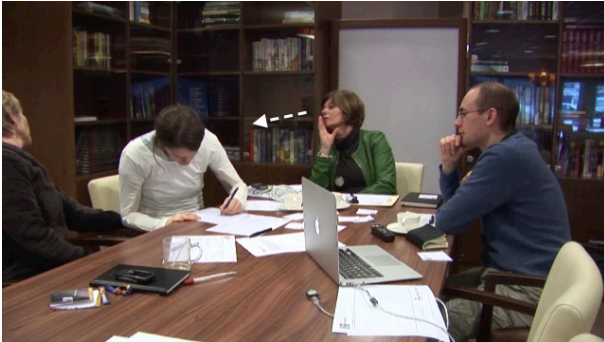
Fig. 8: Actually lower, l. 10 Excerpt 7

Again, we see that when a speaker directs her gaze and hands towards the prototype, other participants will gaze in the same direction. The other two participants however, do not gaze at the sensors. B, who sits in front of P, would have to stand up and walk to the other side of the table in order to see, and P, wearing the shirt, would have to take it off. A's hand movements are out of her sight, and A does not seem to directly touch the shirt, so P does not feel her gestures either. Hence, in this case, the participants do not have mutual gaze on the features talked about.