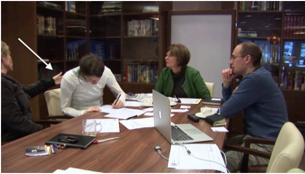
Fig. 7: 'Those sensors' l. 8, Excerpt 7