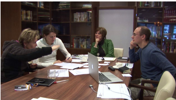
Fig. 10: 'When you move' - I. 6 Excerpt 8

Right after (1.5) A mimics the movement you'd have to make for the shirt to stretch like this by moving her torso forth and back, while keeping the hand in position, and finishing off with repeating the stretching motion: