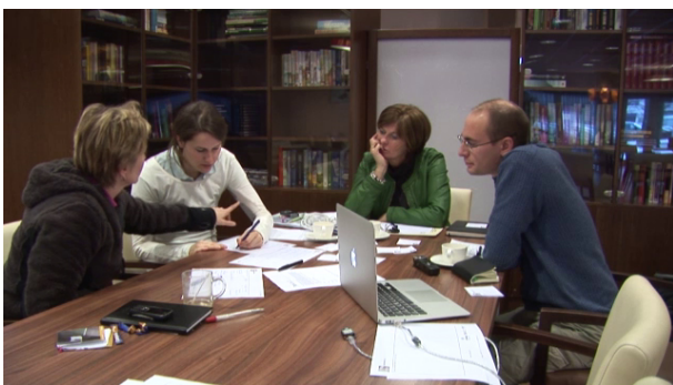
Fig. 5: Pointing at the prototype, l. 1 Excerpt 5

A is not only gazing and pointing but also instructs the participants verbally to direct their attention to the sleeve ('zie je dat' do you see that', l. 1), which they do, see fig. 5.