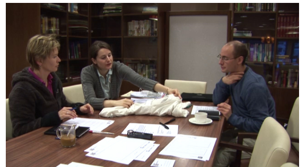
Fig. 3: Arranging the prototype - ( 1.2 in the transcript Excerpt 3)

Hereby P exploits the prototype as an artefact to explicate the design feature 'fashionable'.