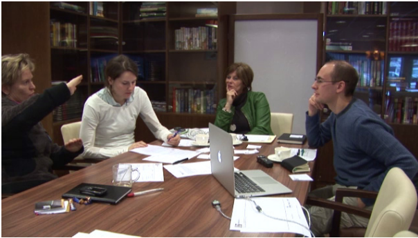
Fig. 9: Manipulating the prototype as if it was there, I 4-5 Excerpt 8

Right after (1.5) A mimics the movement you'd have to make for the shirt to stretch like this by moving her torso forth and back, while keeping the hand in position, and finishing off with repeating the stretching motion: